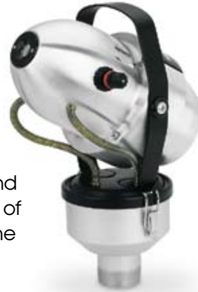
7421 MicroJet DM

landfills, sewage treatment plants, production agriculture and similar large sites.