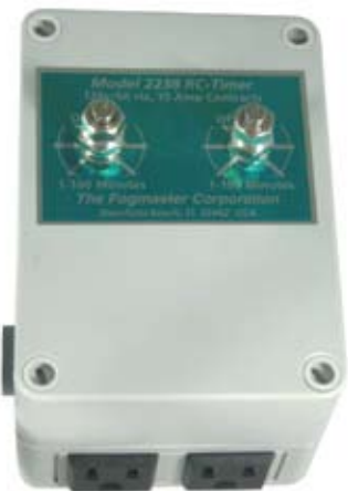
2238 REPEAT CYCLE TIMER

cycles (1-100 minutes each) are set with 1-turn knobs. Compatible with all foggers. International plugs and receptacles available. 120 VAC (P/N 223810); 240 VAC (P/N 223820)