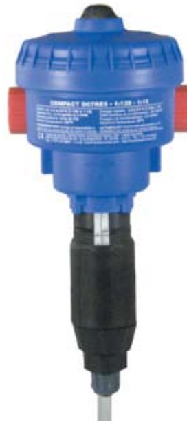
5250 PROPORTIONAL INJECTOR

Four models of the 5250 provide dilution capability from 1:5 down to 1:1500. Each has a