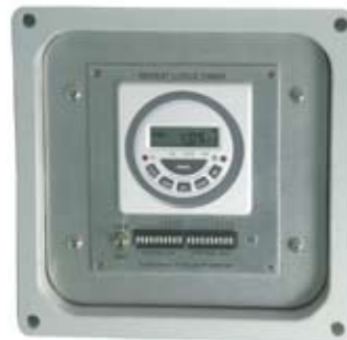
2239 Programmable Timer

Independent ON and OFF times can be set from 1-165 minutes. International plugs and receptacles available. 120 VAC (P/N 223910); 240 VAC (P/N 223920)