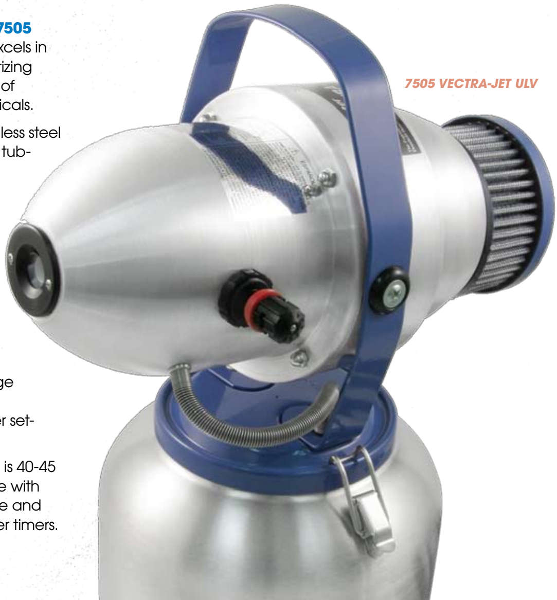
7505 VECTRA-JET ULV

Discharge range is 40-45 ft. It is compatible with the 6100 turntable and with all Fogmaster timers.