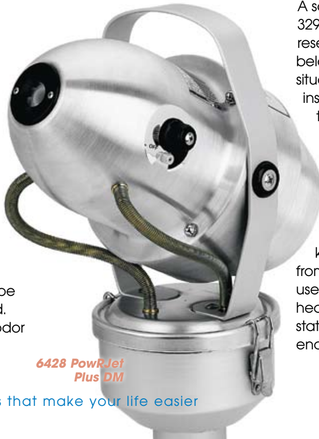
6428 PowRJet Plus DM

We make the foggers that make your life easier