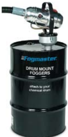
3290/4180 HighJet/SewrJet DM

Mechanically identical to our 6329 model, but includes a one-turn control valve to adjust liquid output and droplet size (intermediate fog to heavy wet fog). The dispensing rate can be calibrated in the field. Extensively used for odor control in solid waste transfer stations,